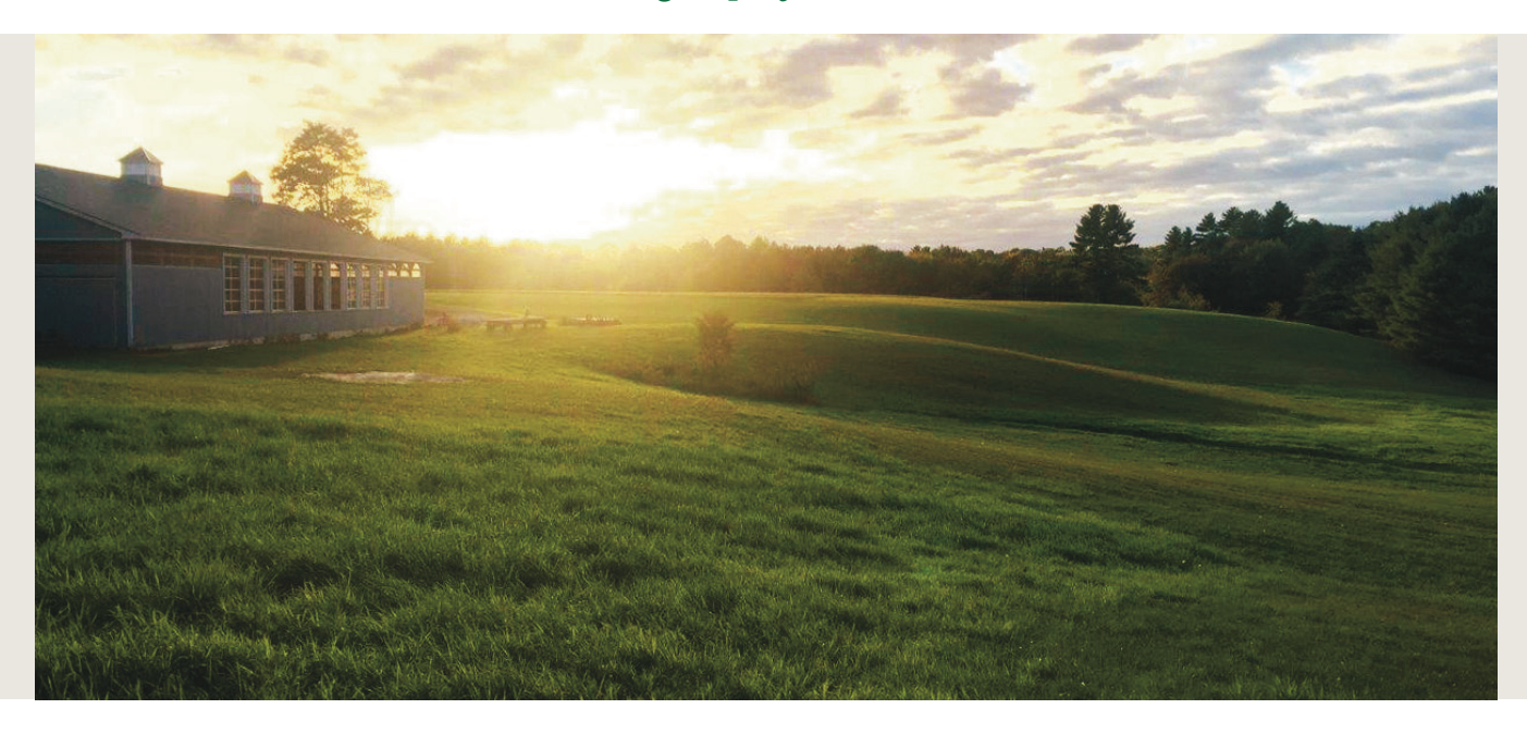
Spring Creek Farm is now available for film and photography location rentals.